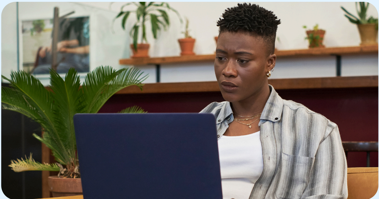
Gender Spectrum Collection

Lastly, to create products that better serve all of its users, the company should make a public commitment to continuously diversify its workforce, and ensure accountability by annually publishing voluntarily self-disclosed data on the number of LGBTQ employees across all levels of the company.