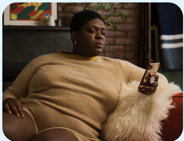
Gender Spectrum Collection

As a US-based non-profit organization GLAAD’s focus is primarily domestic; however, there are enormous global implications of this work, and GLAAD calls upon platforms to take responsibility for the safety of their products worldwide. 18 Social media platforms are vitally important for LGBTQ people, as spaces where we connect, learn, and find community. 19 While there are many positive initiatives these companies have implemented to support and protect their LGBTQ users, 20 they simply must do more. Lastly, as GLAAD has long noted, proposed legislative social media safety solutions must be mindful of not censoring LGBTQ resources or causing unintended harm to LGBTQ users, especially LGBTQ youth. 21