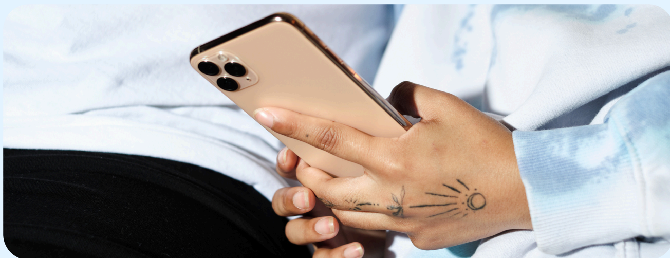
Gender Spectrum Collection

The company continues to provide no transparency on any proactive steps it takes to hire employees from diverse backgrounds. X should make a public commitment to diversifying its workforce, and should publish voluntarily disclosed data showing its progress towards reaching diversity and inclusion goals.