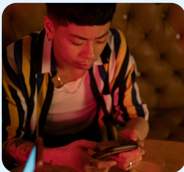
Gender Spectrum Collection

In its 2024 Diversity Annual Report , the company made a public commitment to taking proactive steps to diversify its workforce, and published voluntarily self-disclosed data on the number of LGBTQ employees. However, as has been reported more recently by mainstream news outlets, 41 Google is rolling back its DEI commitments in response to the Trump administration's Executive Orders on DEI. 42 Research for the 2025 SMSI Platform Scorecard is based on public-facing company policies published over the course of the last year, since the company has not added this major stated policy reversal in Google's commitment to diversity and inclusion to its published policies, this change is not reflected in this year's SMSI Platform Scorecard data and will be reflected in the 2026 research.